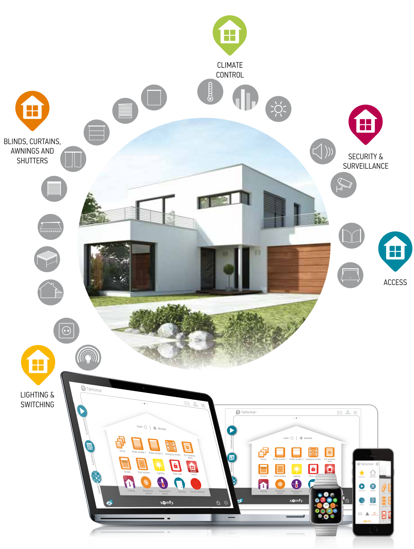
Always connected to your home, wherever you are, from your smartphone, tablet or computer.

If there is an intrusion, the equipment connected to TaHoma® simultaneously activate to protect your home ( security lights will turn on).